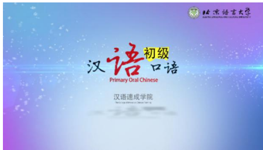
Primary Oral Chinese