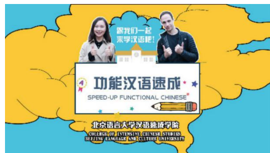
Speed-up Functional Chinese