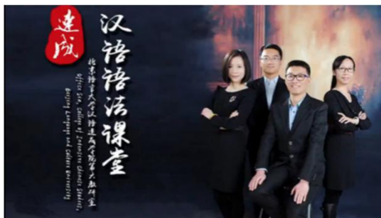
Chinese Grammar Class

CICS Online carefully organized, designed and developed online courses (MOOC) such as Chinese Grammar Class , Speed-up Functional Chinese , Elementary Chinese Grammar Class , Intensive Chinese Grammar (beginner level) , Primary Oral Chinese , and HSK Level 4 Intensive Course . These online courses have advanced teaching concepts and new teaching forms, which fully present the essence of intensive teaching. Among them, Chinese Grammar Class won the National Quality Online Open Course Award, and Speed-up Functional Chinese was eligible for the National Quality Online Open Course Award. The newly launched Quick Connection to the World - Online classroom is praised by foreign students and teaching experts and highly recommended by mainstream media for its high-quality course design and teaching effect.