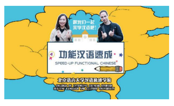
Speed-up Functional Chinese